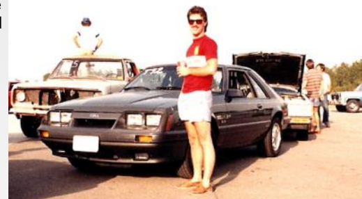
“The GT was used extensively to travel all over FL, made a number of trips back & forth to NY (where I grew up), was auto-crossed, & drag raced at Gainesville Raceway.”

Specifications: 1986 Mustang GT; 5.0L V8; 5 speed; Multi-port sequential Fuel Injection; 200hp; Cruise Control, Power locks, Premium sound. Modifications: Very much stock except 140 MPH Speedo, short throw shifter, pony wheels, black hood graphic (stock is grey)