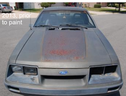
2013, prior to paint

Specifications: 1986 Mustang GT; 5.0L V8; 5 speed; Multi-port sequential Fuel Injection; 200hp; Cruise Control, Power locks, Premium sound. Modifications: Very much stock except 140 MPH Speedo, short throw shifter, pony wheels, black hood graphic (stock is grey)