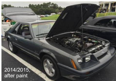
2014/2015, after paint