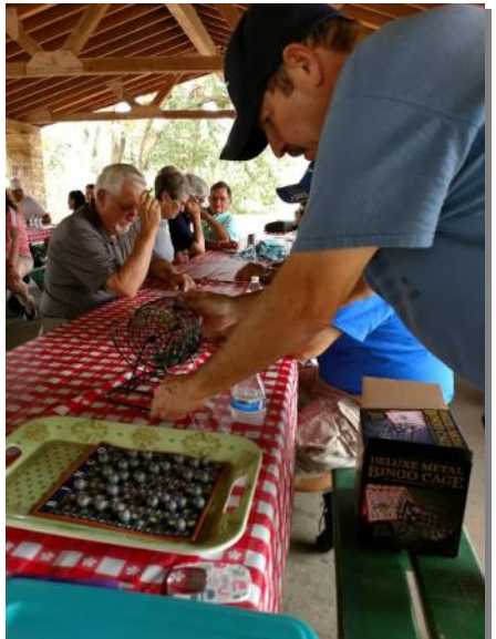
Pictured at left and right are the Bingo Winners.