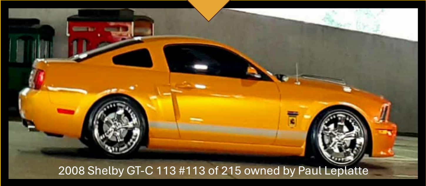
2008 Shelby GT-C 113 #113 of 215 owned by Paul Leplatte