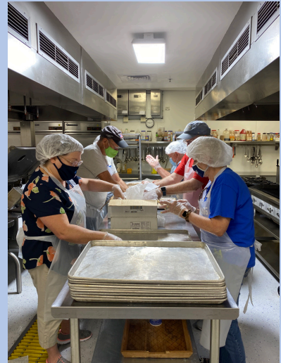
Above/below: Sausage Challenge: How fast can you fill two racks, double stacked?