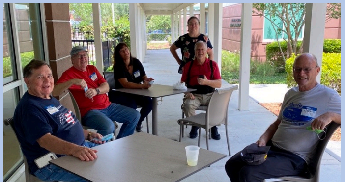
Tired, but not vanquished!